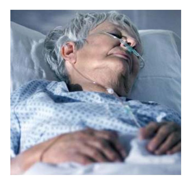
Fatal: The pathway involves withdrawal of lifesaving treatment, with the sick sedated and usually denied nutrition and fluids. (Posed by model)

But Mr Hunt yesterday suggested that concerns about the system were relatively minor compared with its benefits.