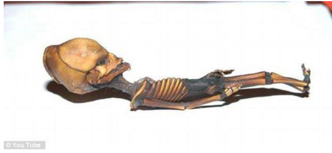
The small skeleton bears many of the hallmarks of what we have come to believe ETs look like, in particular a large head overshadowing a small body

'The DNA tells the story and we have the computational techniques that allows us to determine, in very short order, whether, in fact, this is human,' Nolan, who performed the DNA tests, explains in the film.