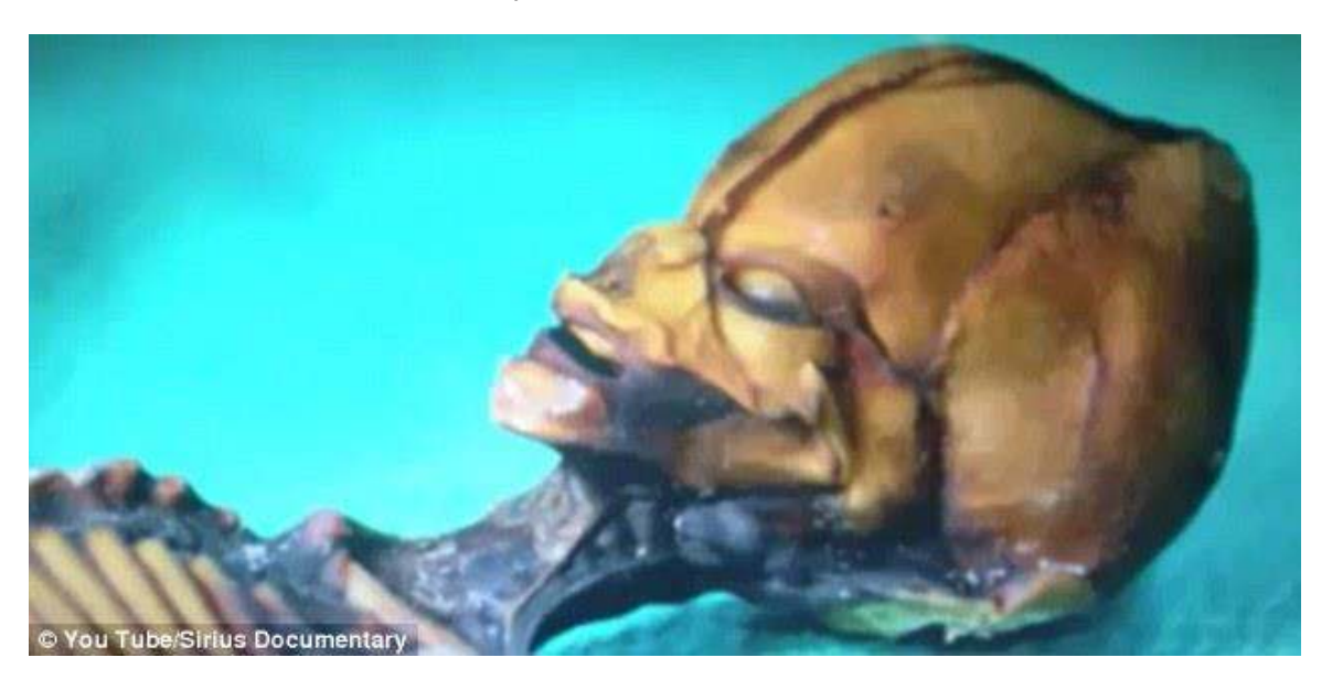
Scientists say DNA tests have revealed the unusual remains to be human rather than alien