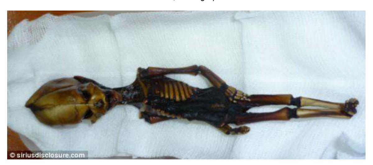
The humanoid was first discovered in 2003 in the remote Atacama Desert region of Chile

In the new documentary, a DNA sample from bone marrow extracted from the specimen, was analyzed by scientists at a prestigious American university.