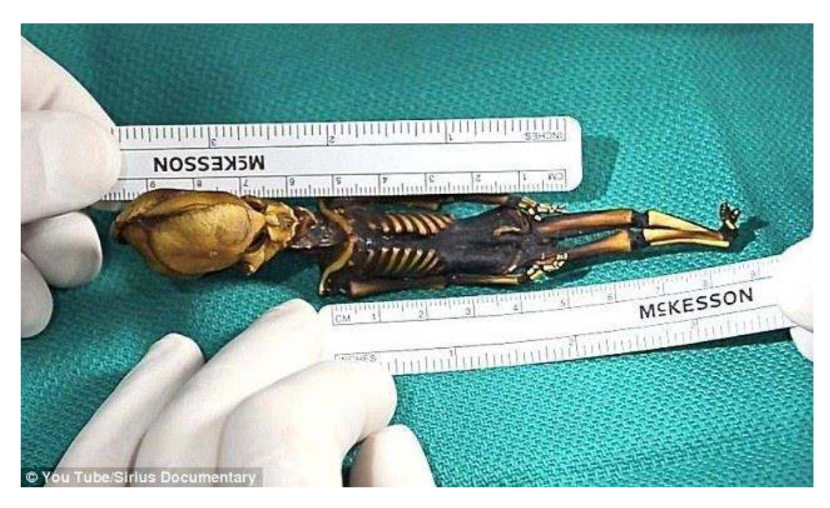
A new documentary film Sirius has revealed that the mummified remains of a six-inch supposed 'space alien' are in fact human