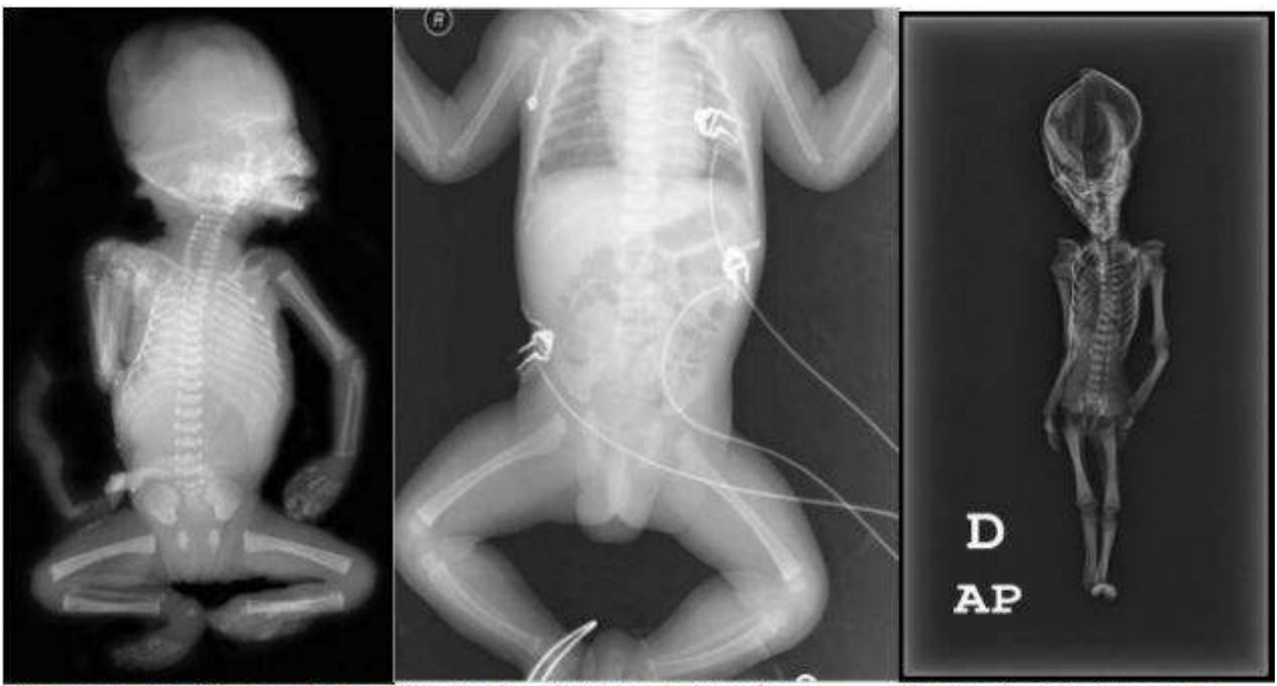
Illustration 5: Human Fetus Illustration 6: Human Newborn