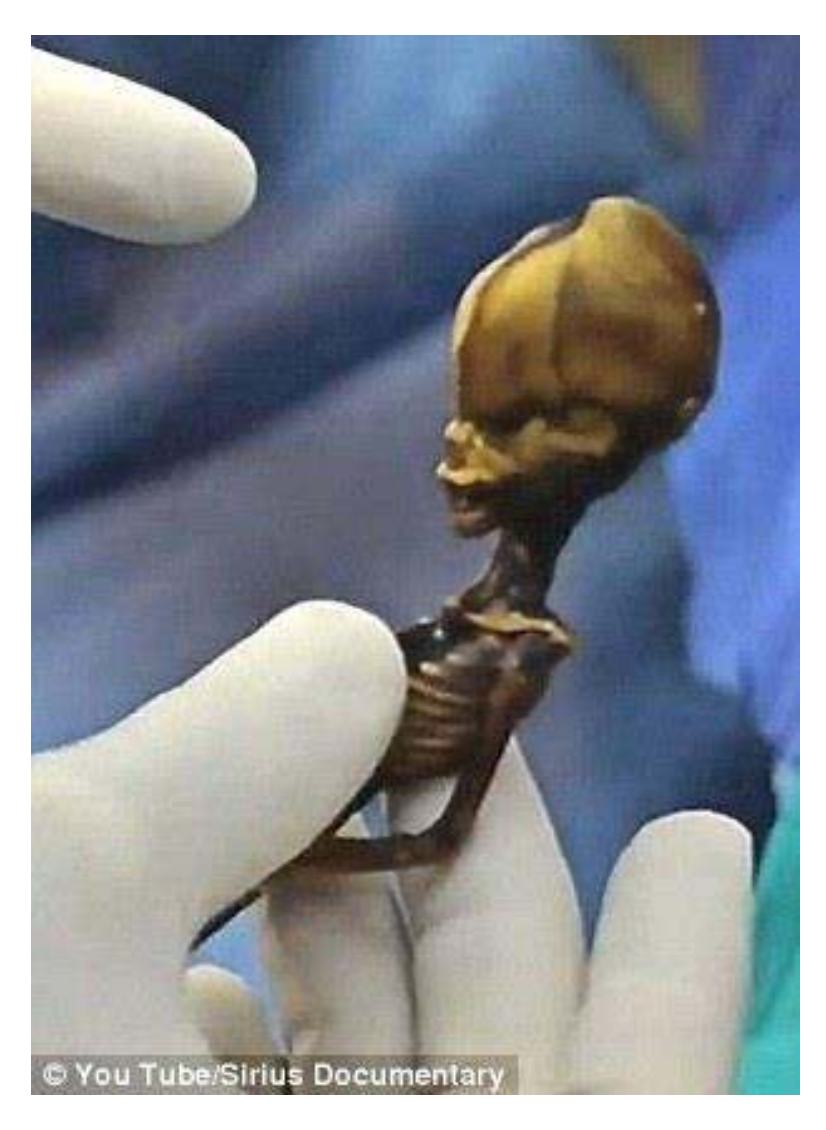
Scientists believe the unusual skeleton is human, yet it has nine ribs