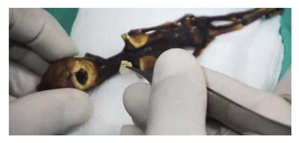
Scientists concluded that the skeleton was an 'interesting mutation' of a male human that had survived post-birth for between six and eight years

http://www.dailymail.co.uk/sciencetech/article-2313828/ls-really-human-DNA-tests-inch-skeleton-alien-looking-creature-sized-head-prove-actually-human-claim-scientists-new-documentary.html