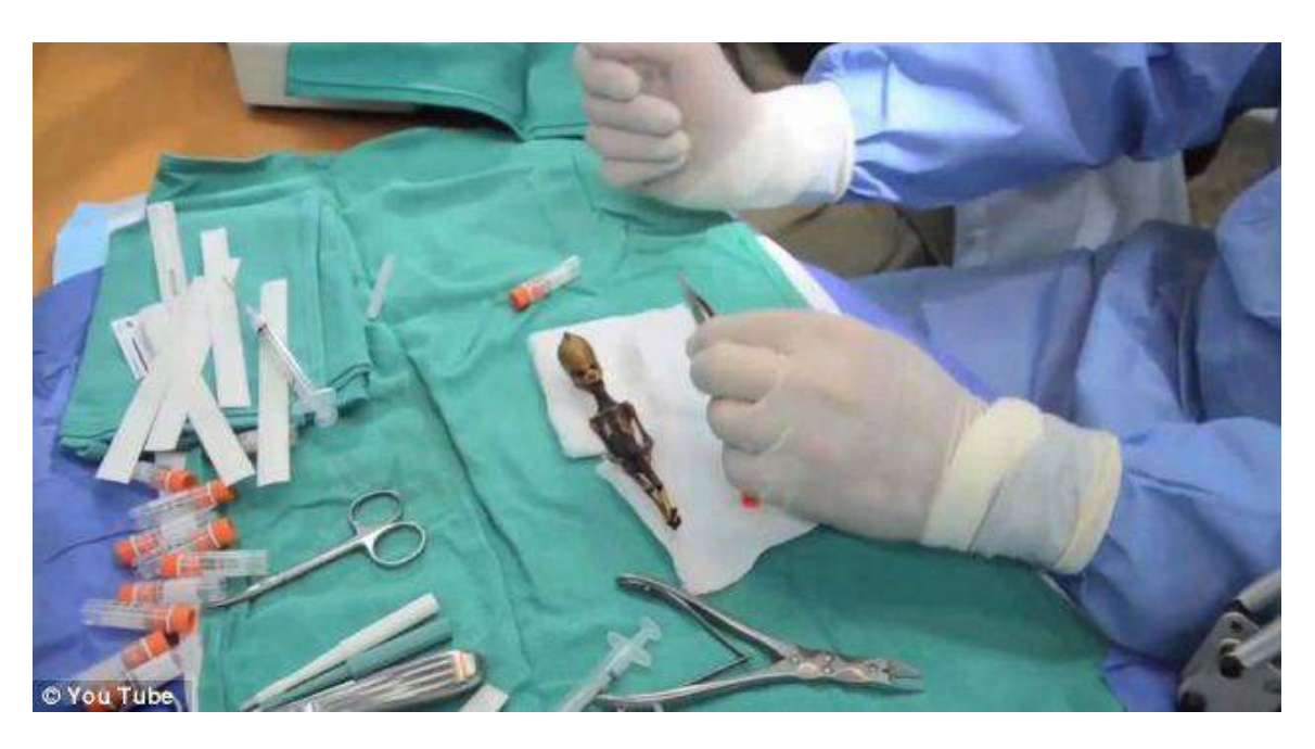
A DNA sample from bone marrow extracted from the specimen, was analyzed by scientists at a prestigious American university