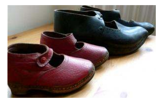
Above - Children's Clogs