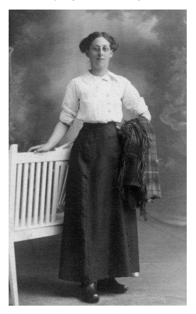
Above - Lancashire Lass with Clogs and Shawl

Clogs were the customary wear in a weaving shed where the weaver stood on a flagged floor that was cold and often damp. The clog iron, which lifted the wood base clear of the wet floor by oneeighth of an inch, was very beneficial to the weaver from a health point of view. In the clatter of a weaving shed the extra noise caused by clogs did not even register.