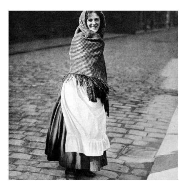
Above - Lancashire Mill Worker with Traditional Shawl