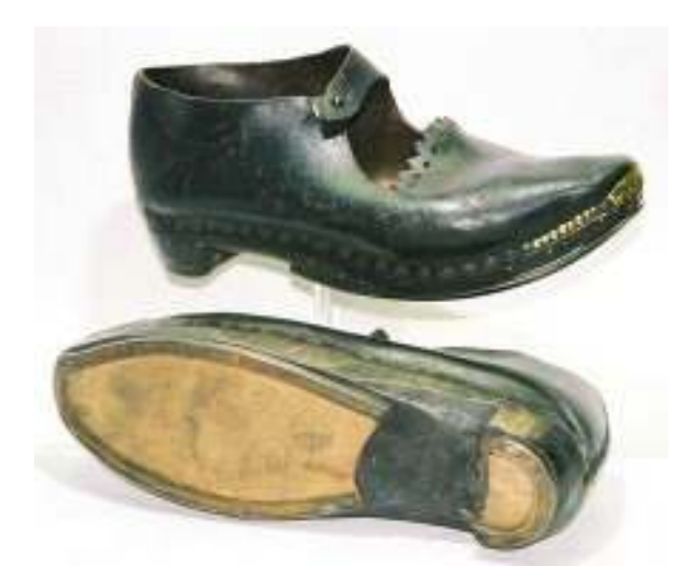
Above - Clogs for Women

Children's clogs had a button for the fastener, and the clog sometimes had more ornamentation with the half-inch broad toe piece of brass being a decorative touch.