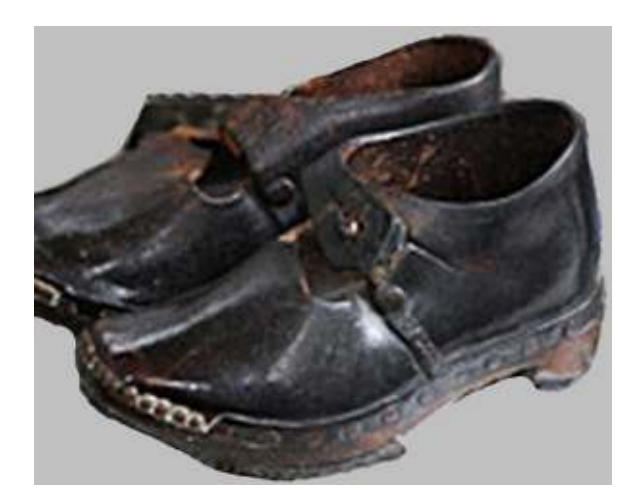
Above - A Practical Pair of Children's Clogs

There were even red clogs for a baby. It was the only time that a departure from the traditional black was permitted.