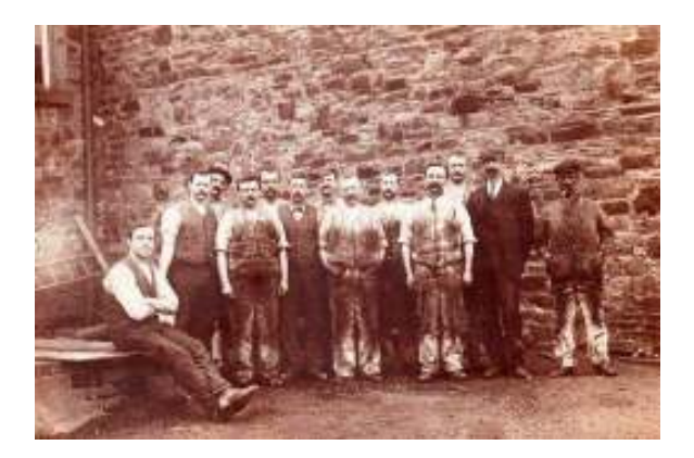
Above - Mill Yard Workers, c.1900

Men's clothing was not exceptional - c.1900, and a factory worker was reported to be wearing a cloth cap, red neckerchief, check shirt, fustian trousers, waistcoat, and clogs.