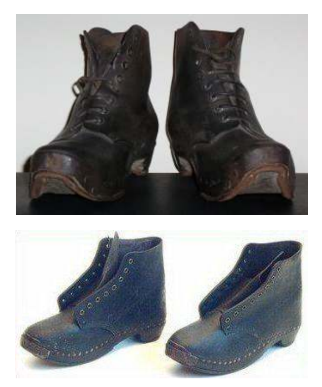
Above - Men's Work Clogs

Ordinary clogs for men were fastened with a clasp.