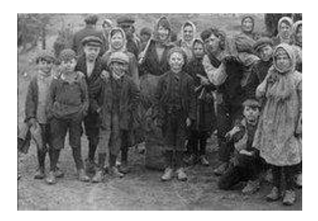
Above - Children Wearing Clogs

Clogs were not worn in the spinning mill because the clog irons on the alder soles would have damaged the wood on the floors. However, the operatives often wore their clogs and shawls when going to and from work.