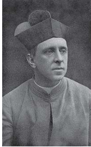
Monsignor Robert Hugh Benson (18 Nov 1871 – 19 Oct 1914)