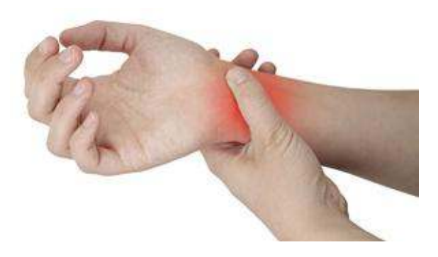
Above - RSI Localised Pain

Localised pain will typically manifest in the joints or muscles and can consequently affect the functioning of the fingers, hands, wrists, arms, neck, shoulders, and upper back, etc.