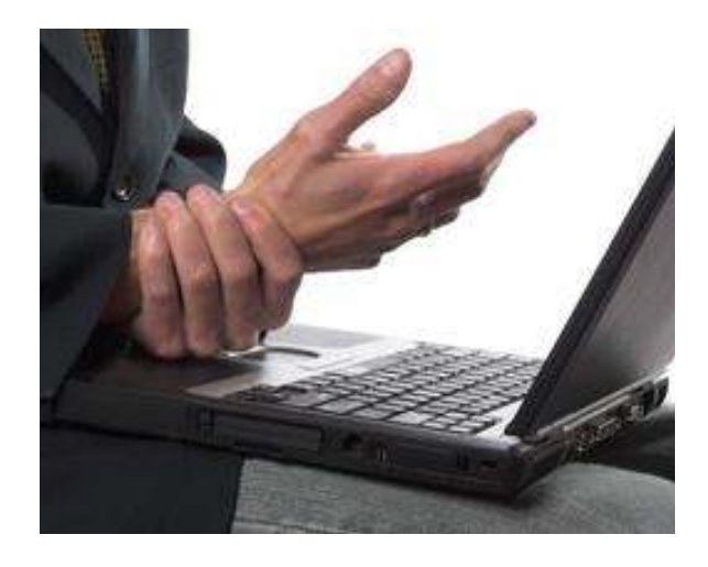
Above - Computer related Repetitive Strain Injury

In general terms, a computer related repetitive strain injury occurs when excess stress is placed on a particular joint, such as the wrist joint. Consequently, when that stress occurs repeatedly, the wrist does not recover quickly enough and the joint becomes irritated and inflamed. The body will automatically react to the irritation by introducing fluid into the affected area and try to reduce the stress on the muscle or tendon.