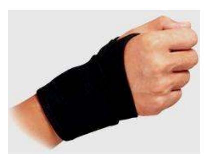
Above - An Elastic Support